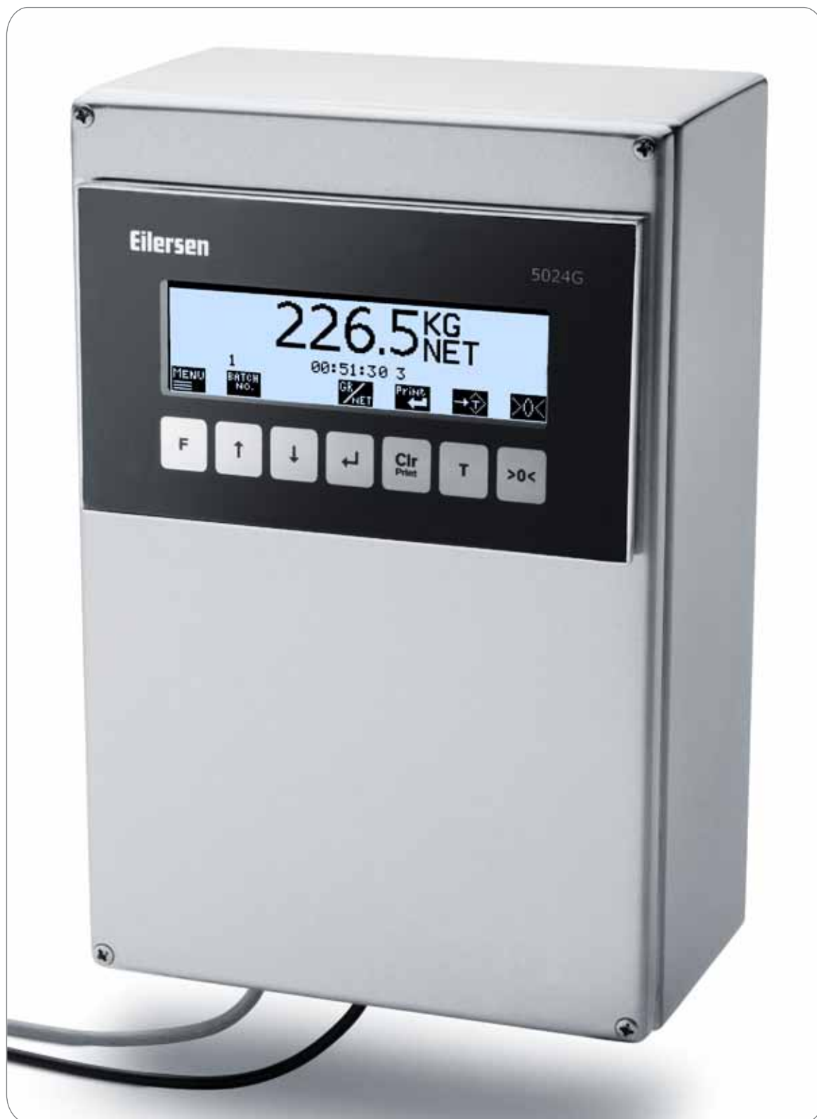
▲ Weighing terminal type 5024G mounted in stainless steel box